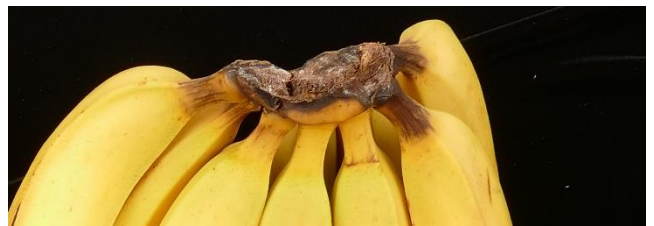
Figure 2. Photograph showing banana fruit mouldy appearance on stem.

Storing fruit in the Maze® bag also slowed down the ripening process by 5% relative to the industry standard liner. Once the fruit were removed from the MAP and bags, ripening proceeded normally and there was no detectable