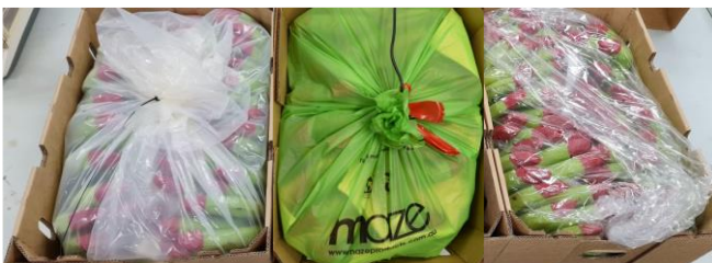
Figure 1. Photograph showing banana fruit inside a PerfoTec® MAP, Maze® bag and perforated poly liner (left to right).

Green mature Williams Cavendish Ecoganic® banana fruit were stored in 1) industry standard perforated poly liner, 2) PerfoTec® MAP biodegradable bag, and 3) Maze® poly compostable and biodegradable bag for 4 weeks at 13°C to simulate seafreight. The fruit were removed from the packaging and ripened with 100 parts per million of ethylene for 48 hours at 16°C as per commercial practice. Fruit quality was evaluated before ripening and 5, 6 and 7 days post ripening. Peel colour, fruit firmness, defects, mouldy appearance, and stem rot incidence were assessed.