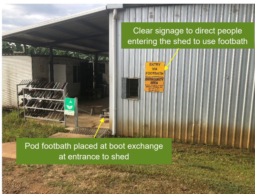
Pod footbath placed at boot exchange at entrance to shed.

Overall, the grower said, 'We have found that if you make biosecurity easy to do, practices will be followed'.